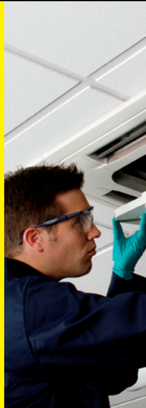
Above: A maintenance engineer inspects an evaporator unit