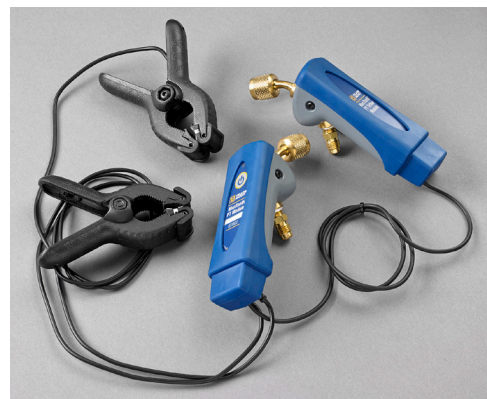
67002 ManTooth Dual Pressure Wireless Digital P/T Gauge

comes with a P/T module, tether unit and two temperature probe clamps. This unit also includes a convenient carrying case which can be purchased separately for the single pressure unit.