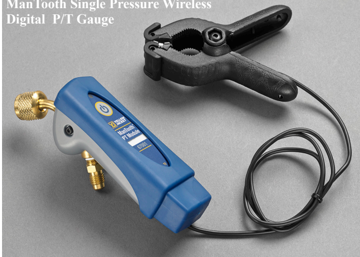
67001 ManTooth Single Pressure Wireless Digital P/T Gauge

The YELLOW JACKET® ManTooth™ Single Pressure Wireless Digital P/T Gauge (Part #67001, shown at left) includes a single hardware device and clamp.