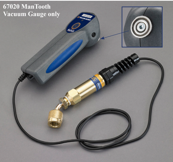
67020 ManTooth Vacuum Gauge only

Eliminate tools, save time, and monitor vacuum process wirelessly.