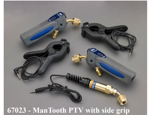
67023 - ManTooth PTV with side grip

The YELLOW JACKET ManTooth PTV (67023) shown below provides the full set for high and low side readings which includes dual non-tethered pressure/temperature gauges, two wired temperature clamps, and one interchangeable vacuum gauge. The single ManTooth PTV (67021) can